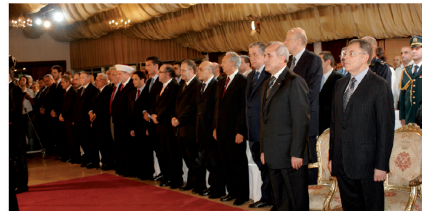
Standing for the Lebanese national anthem