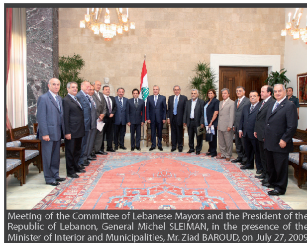
Meeting of the Committee of Lebanese Mayors and the President of the Republic of Lebanon, General Michel SLEIMAN, in the presence of the Minister of Interior and Municipalities, Mr. Ziad BAROUD, on July 27, 2009

This process was managed by the Office of United Cities and Local Governments (Lebanon, Syria, Jordan) / Technical Office for Lebanese Municipalities (UCLG/BTVL) and has led to the organization of the International Seminar “Decentralization in the Near East”. The seminar was held on the 17th, 18th and 19th of October 2009; it was inaugurated by the President of the Republic of Lebanon, General Michel SLEIMAN and concluded by a speech of the Minister of Interior and Municipalities, Mr. Ziad BAROUD.