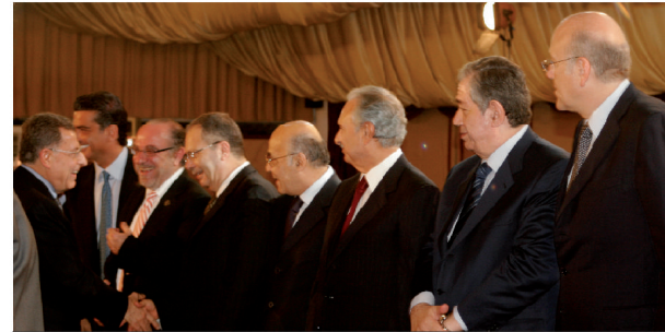
Lebanese Prime Minister, Mr. Fouad SINIORA greets the dignitaries attending the conference