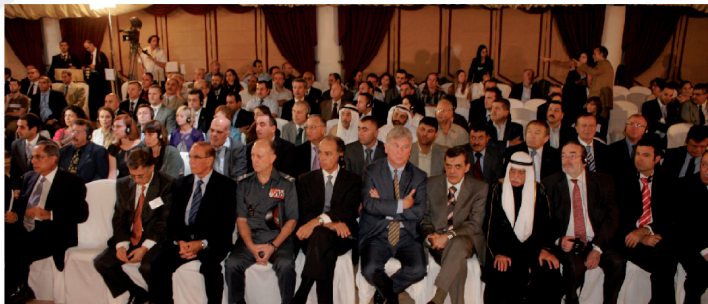
View of participants